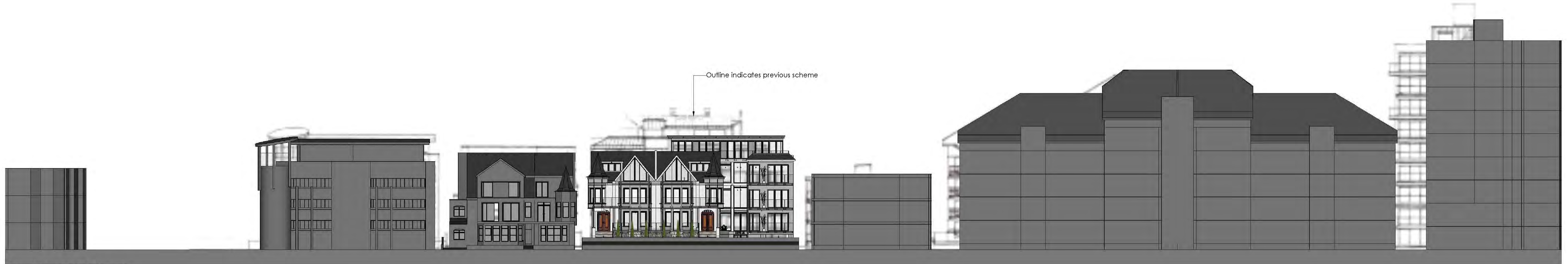
1 Street Scene Front Elevation